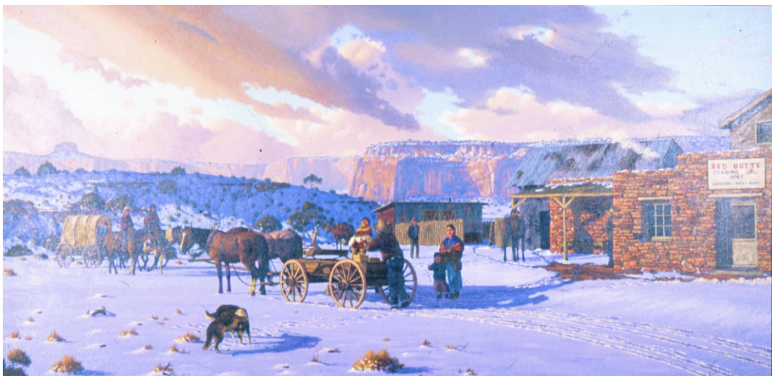
24" X 48" - O/C