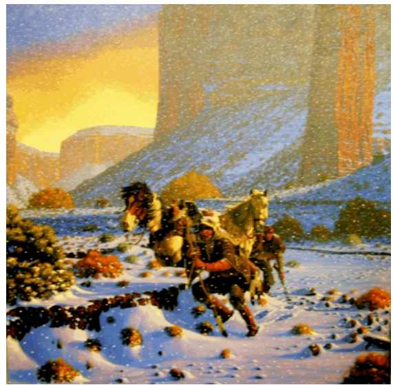
34" X 20" - O/C