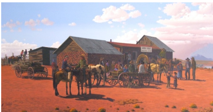
24" X 48" - O/C