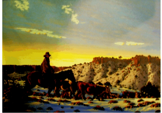
20" X 24" - O/C