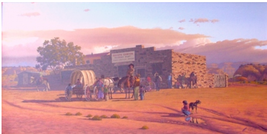
24" X 48" - O/C