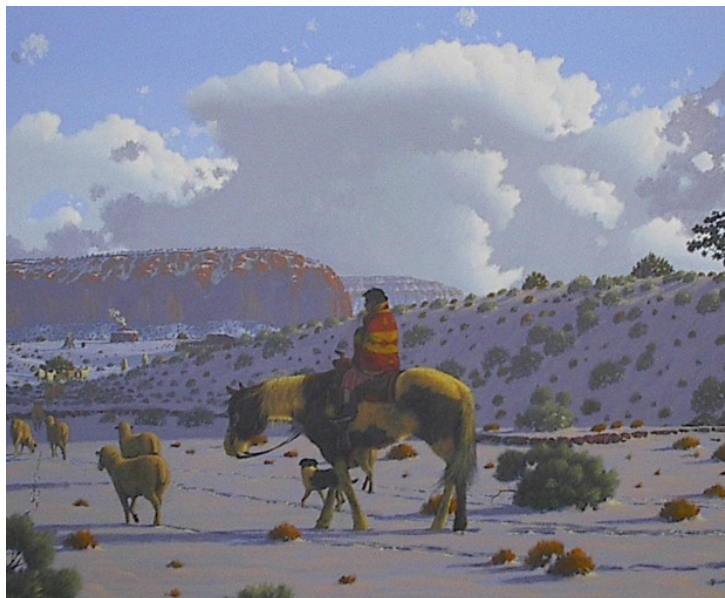
20" X 24" - O/C