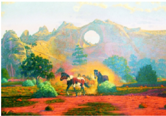
20" X 24" - O/C