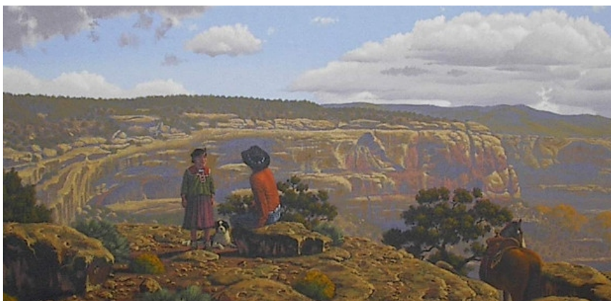
12" X 24" - O/C