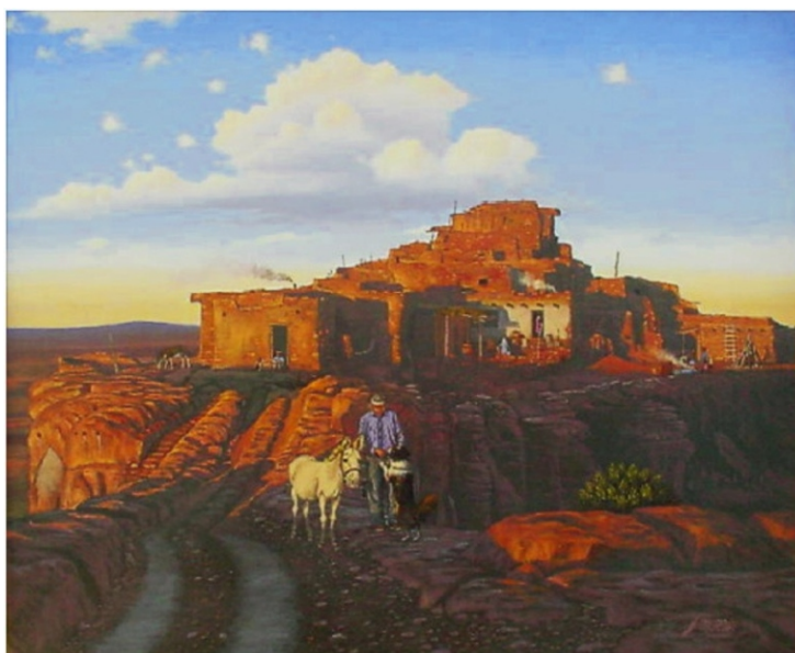
20" X 24" - O/C