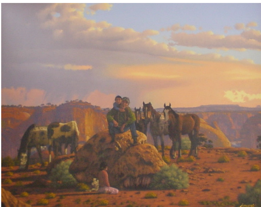
24" X 36" - O/C